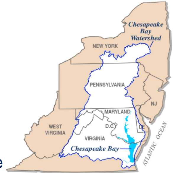
Figure 1. Chesapeake Bay watershed and surrounding area.